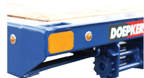
3/4" LED Lights (Standard)