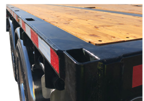
Tubing Outer Rail (Option)