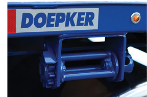
Large Release Tab on Winches (Standard)