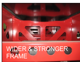
WIDER & STRONGER FRAME