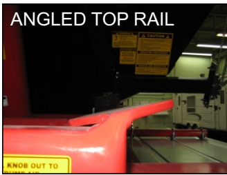
ANGLED TOP RAIL