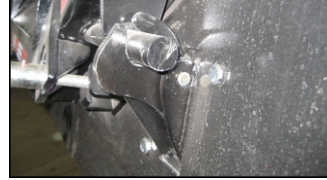
ENDGATE CLAMPING SYSTEM